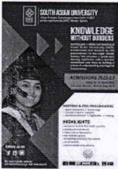
poster 2022 green.jpg 3595K