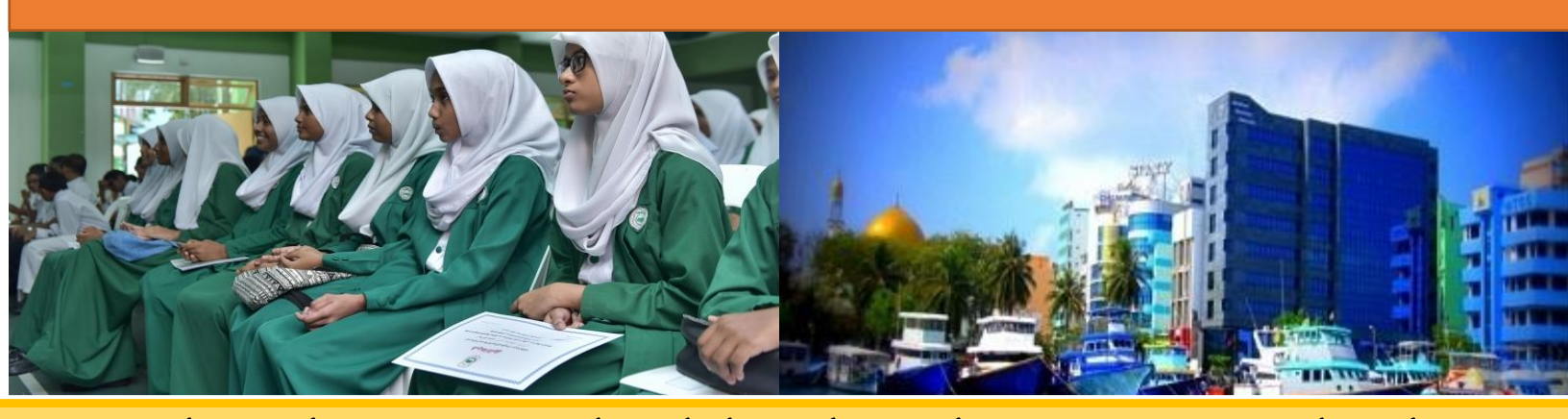
The Enhancing Employability through Human Capital and Entrepreneurship Development Project